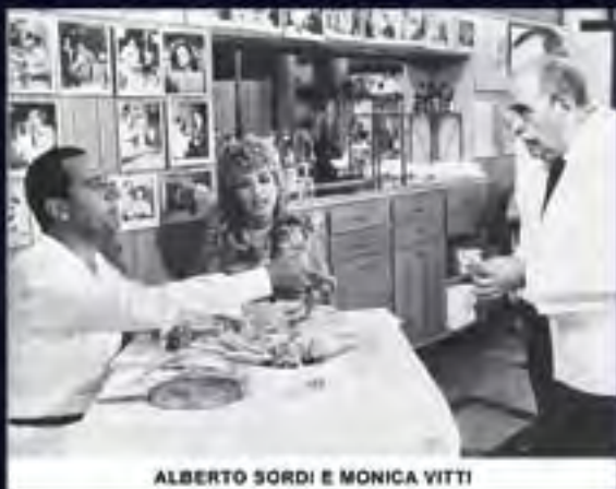
ALBERTO SORDI E MONICA VITTI