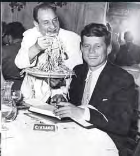
JOHN F. KENNEDY