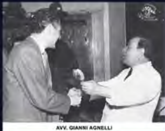
AVV. GIANNI AGNELLI