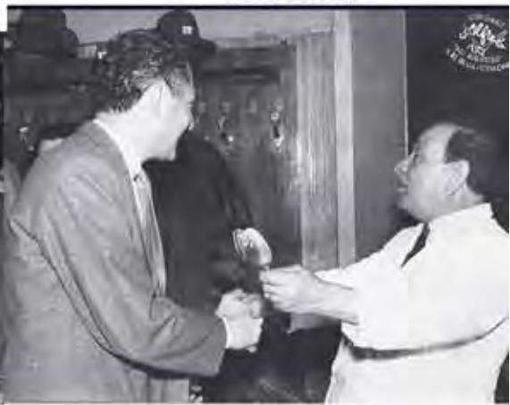
AVV. GIANNI AGNELLI