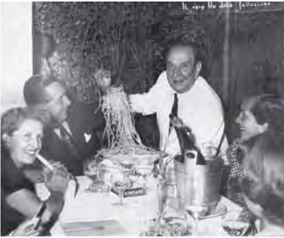
WALT DISNEY E FAMIGLIA