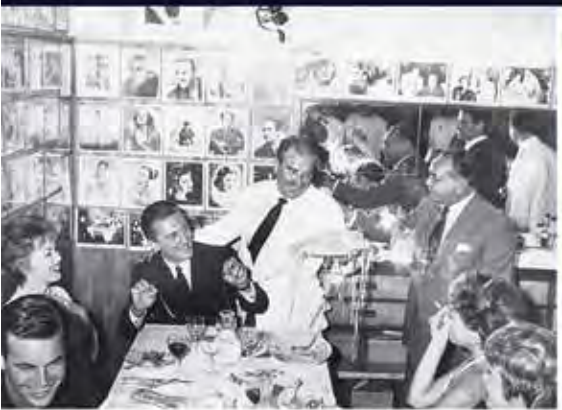
KIRK DOUGLAS - EDWARD G. ROBINSON - BARBARA RUSH