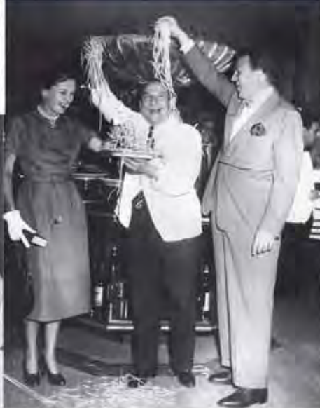
HENRI FORD E SIGNORA