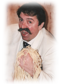
ALBERTO SORILE MONICA VITTI

Alfredo's Gallery is the new frontier of food for the guest who wants to enjoy a quick meal without sacrificing the quality of Italian cooking, and for what, however, loves comfort and a menu full of specialty. IL VERO ALFREDO always within shines with culinary excellence of exquisite service and unique atmosphere resulting from the brand and the charm of historic and essential elements such as Photo Gallery, the Guest books, gold tableware, and all the charm that distinguished